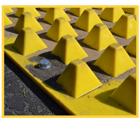
FODS Concrete Screw Anchor

To ensure proper performance and safety, FODS Track out system must be anchored in place. Proper anchoring procedure will vary depending on use and substrate condition. FODS Concrete Screw Anchor or FODS Round Head Form Stake should be used to secure mats in place. FODS anchoring systems are sold separately.